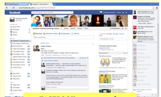
FACEBOOK group page for Students' Cultural Exchange