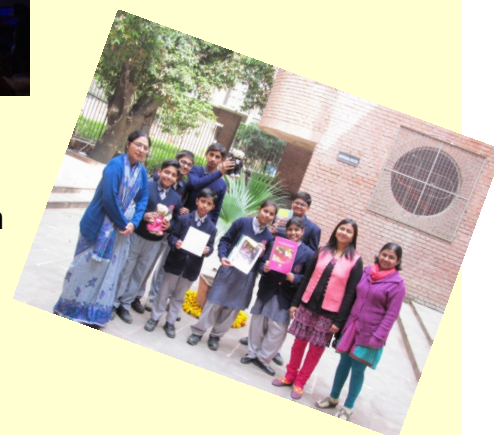
OUR STUDENTS WITH THE MAS-COT SENT BY ST. IVO SCHOOL'S STUDENTS

We have nurtured a very enriching partnership with UK's Saint Ivo School of Cambridgeshire over the last six months. Our students have forged strong bonds with the UK students through various means of online and offline interactions. The two schools exchanged goodwill mascots with each other, apart from exchange of letters and diaries by students to each other. The UK-based group also shared with us a documentary about their school. Many of our students have become pen-friends with the students of St. Ivo School.