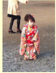
A CHILD IN TOKYO IN TRADITIONAL JAPANESE DRESS—KIMONO. PHOTO CLICKED BY OUR STUDENT

Our students returned enriched from their Tokyo visit. We organized special session where they discussed their experience with other fellow students and the entire school community. Our school will promote such horizon-enhancing activities in future for the overall nurturing of the students.