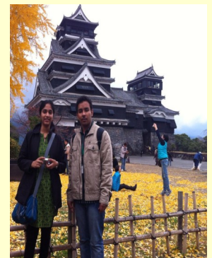
BVB STUDENTS AT THE TOKYO CASTLE