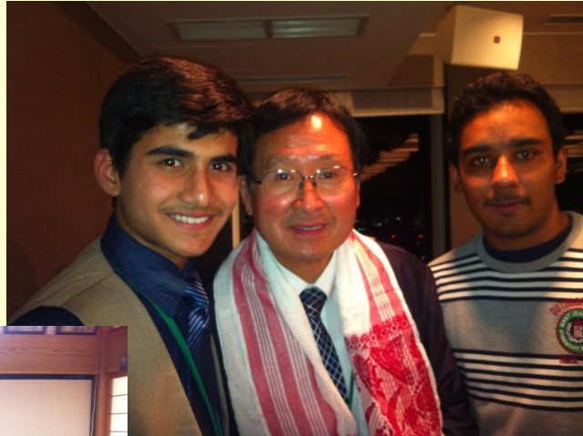
Learning and meeting people in Japan