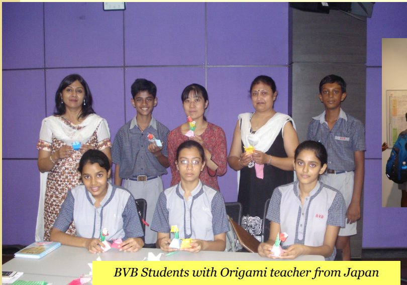
BVB Students with Origami teacher from Japan