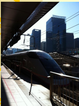
Bullet Train in Japan