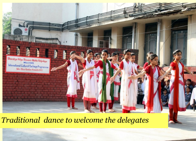
Traditional dance to welcome the delegates