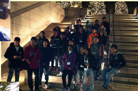
Delegation of Indian students in Tokyo