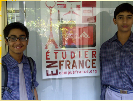
AT ALLIANCE FRANCAISE, NEW DELHI