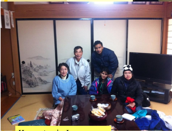
Home stay in Japan