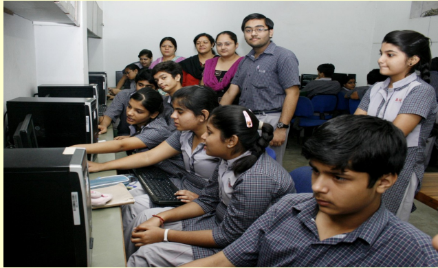
POWERPOINT PRESENTATION ABOUT FESTIVALS OF FRANCE