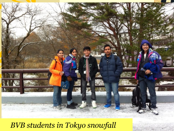
BVB students in Tokyo snowfall