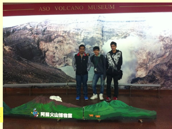
A visit to the volcano museum